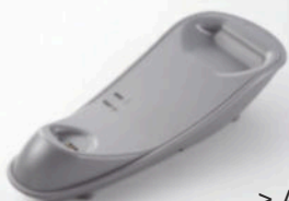
> AS-8020CL charging cradle