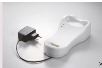
> AS-8520 charging cradle